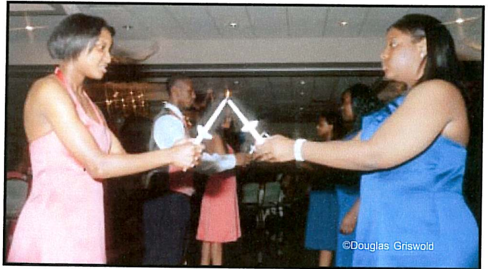
TSTM seniors (r) perform the annual passing of the torch to the juniors.