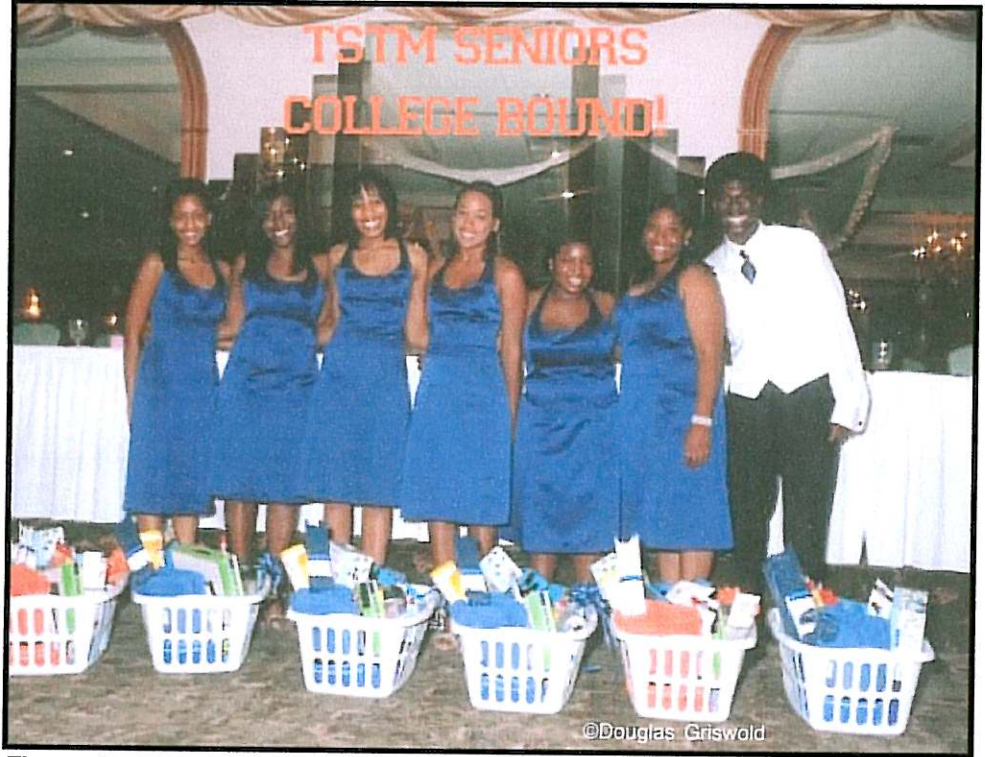
The graduates and their college gift baskets. Some students also received scholarship awards and book awards.